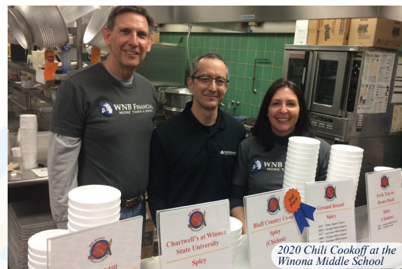
2020 Chili Cookoff at the Winona Middle School