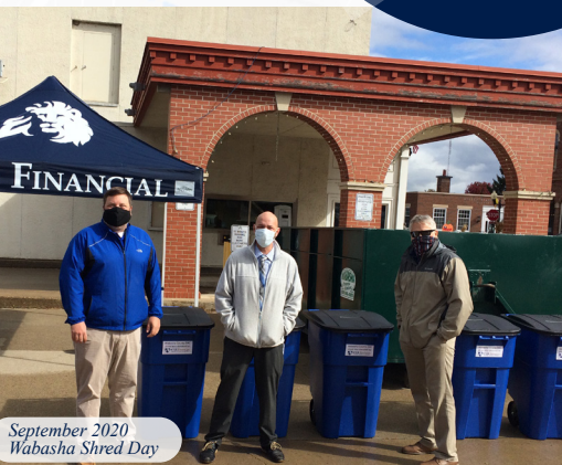
September 2020 Wabasha Shred Day