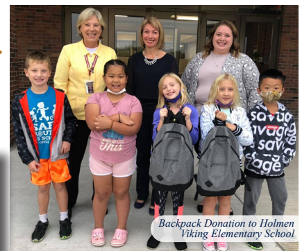
Backpack Donation to Holmen Viking Elementary School