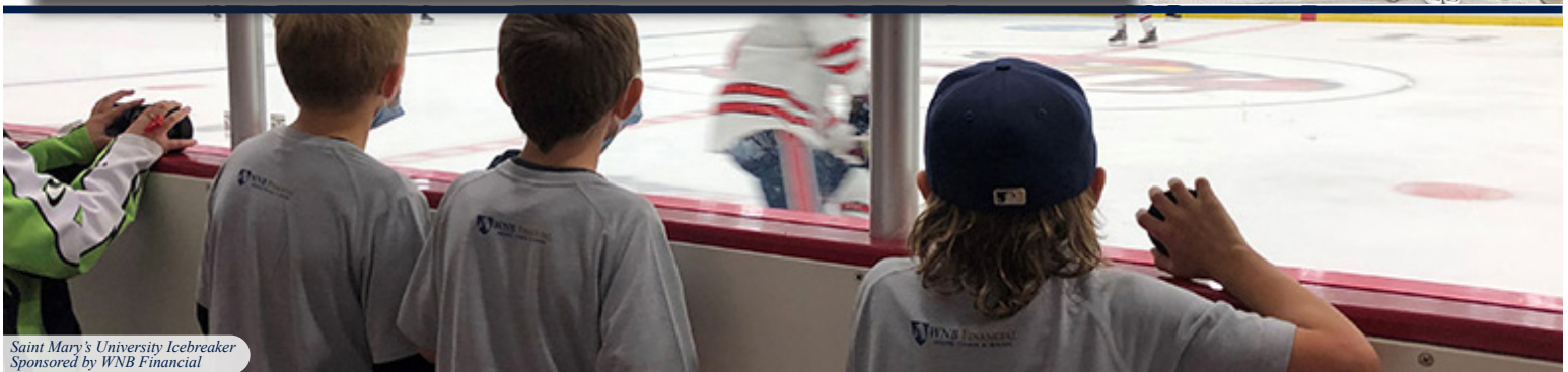
Saint Mary's University Icebreaker Sponsored by WNB Financial