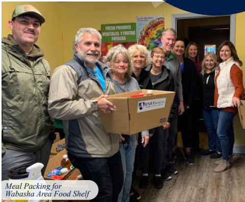
Meal Packing for Wabasha Area Food Shelf