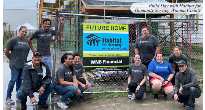
Build Day with Habitat for Humanity Serving Winona County