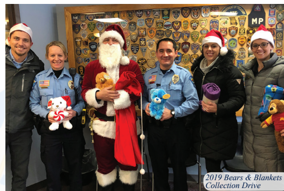
2019 Bears & Blankets Collection Drive