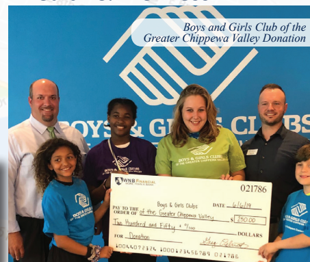
Boys and Girls Club of the Greater Chippewa Valley Donation