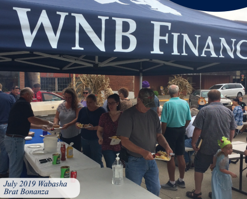
July 2019 Wabasha Brat Bonanza